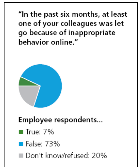
Pie chart 2